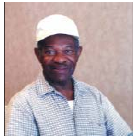
Leon is an example of your gifts at work. Read about Leon and how your gifts make a difference.

Directions: Linton Hall Manor is on Linton Hall Road, Bristow, exactly midway between Routes 28 and 29. Look for the balloons!